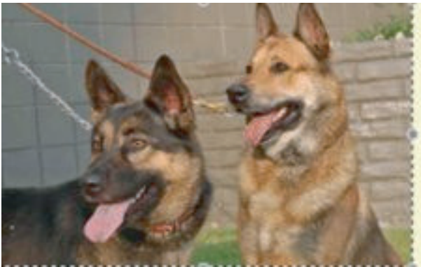
Winston and Dixie

For more information on these dogs, and others in the care of German Shepherd Rescue of Orange County, visit: www.gsroc.org .